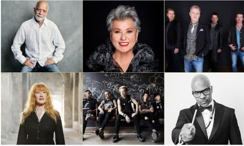
Top (L-R): Dan Hill, Ginette Reno, Glass Tiger, Loreena McKennitt, Sum 41, Maestro Fresh Wes

The Canadian Academy of Recording Arts and Sciences (CARAS) has announced the four inductees for the Canadian Music Hall of Fame Induction Ceremony, presented by Music Canada . Industry legend Dan Hill , grande dame of Québec song Ginette Reno , rock superstars Glass Tiger , eclectic Celtic singer/songwriter/composer Loreena McKennitt , pop-punk icons Sum 41 , and hip-hop pioneer Maestro Fresh Wes will all be honoured for their contributions to Canada's music history on May 15 at Studio Bell in Calgary. The spring ceremony follows the induction of Maestro Fresh Wes (during The 2024 JUNO Awards Broadcast in Halifax) and Sum 41, who will be inducted to the Canadian Music Hall of Fame live on the 2025 JUNO Awards Broadcast in Vancouver on March 30.