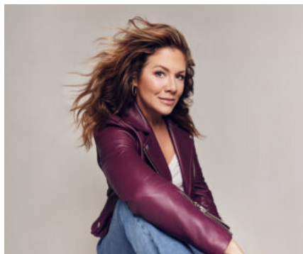
Sophie Grégoire Trudeau

Bell Media and PAGEBOY Productions , founded by actor, producer, and advocate Elliot Page , have announced a new partnership to develop "bold, original scripted series" for Crave and CTV . Under the agreement, their collaboration will explore content opportunities, "with a joint dedication to spotlighting untold stories," according to a Bell Media announcement.